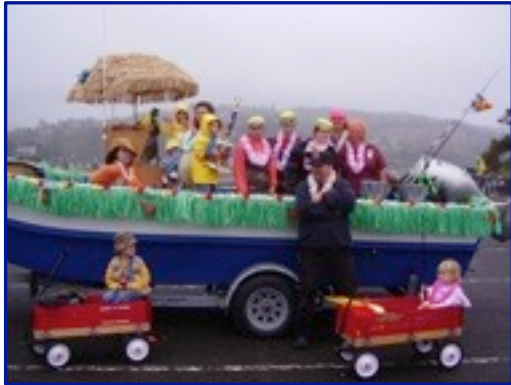
Parade: Saturday, July 18 th at 11am “Memories of the past, dreams for the future”