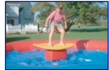
Climbing Wall & Surf Machine at the Cape parking lot for kids of all ages to test their skills Saturday & Sunday 10am to 6pm $2 per climb/ride