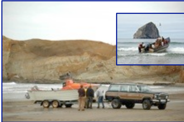
Dorymen’s Association booth & display at the Cape Kiwanda Parking lot